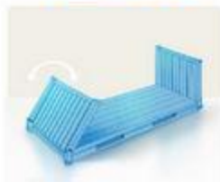
20" FLATRACK COLLAPSIBLE