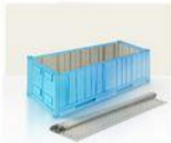
20" OPEN TOP